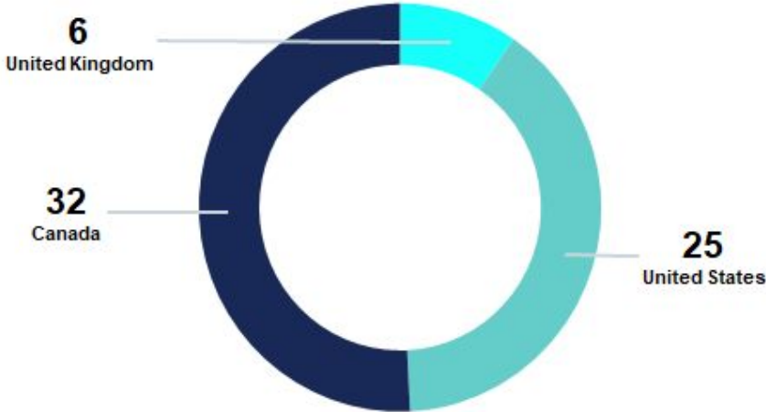
Figure 1 Approved Participants as at December 31, 2020

As at December 31, 2020, following admissions and resignations of Approved Participants, the Bourse had a total of 63 Approved Participants, distributed geographically as follows: